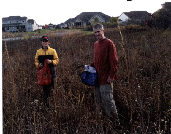
Seed collecting related to a grant for Carity Prairie.

In partnership with the Southeast Wisconsin Watershed Trust, MALC continues restoration of a portion of the Legend Creek watershed at our Carity Prairie property with leading edge technology and traditional restoration. An inflowing storm water drainage swale is being treated with permeable compost filter tubes to contain and filter nutrients and reduce flow energy, combined with several thousand square feet of native seeding downstream of the filter swale.