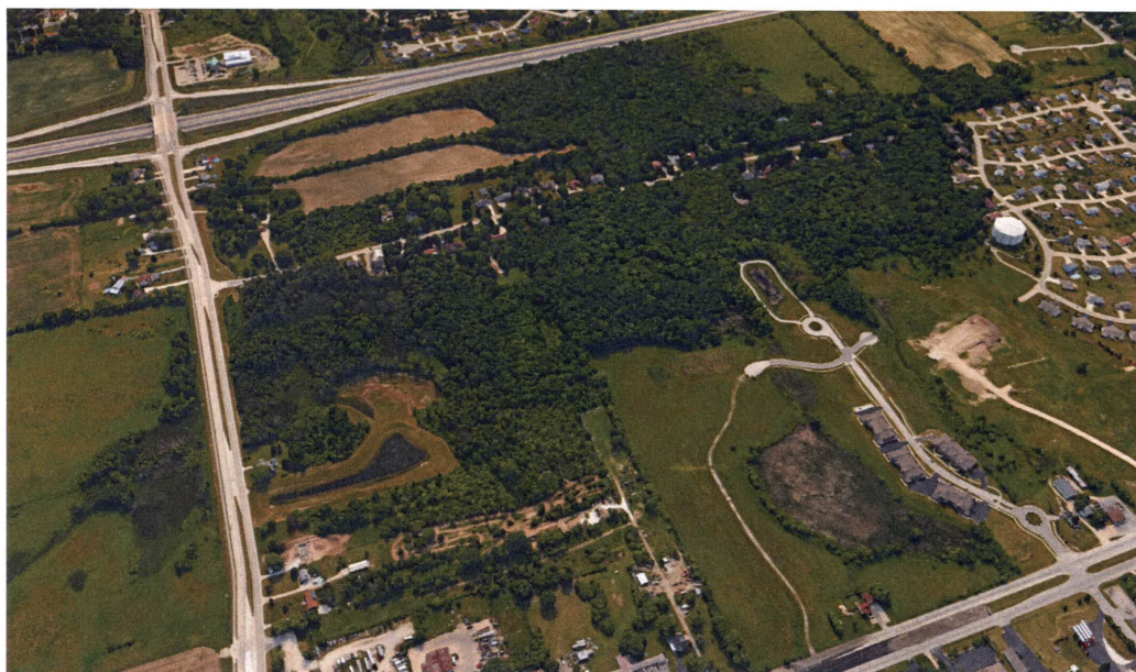
Barloga Woods is a county-owned extension of Falk Park, just south of Drexel Avenue and east of 27th Street in Oak Creek. It is a rich mesic forest of beech, maple oak and hickory with vernal pools.

A group of MALC volunteers are working with Homestead staff to organize the inventories for access by qualified individuals. The collection fills over twenty file drawers and includes Richard's extensive collection of nature photography. Delene Hanson, president of the Homestead and one of the MALC's co-founders, is helping with the work.