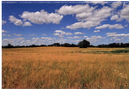
Ryan Creek Prairie

by westerly winds and marked by spreading, grand-mother oaks. It's just one segment of a much larger landscape-scale preserve encompassing the Ryan Creek watershed, Dumke Lake and DNR lands west of